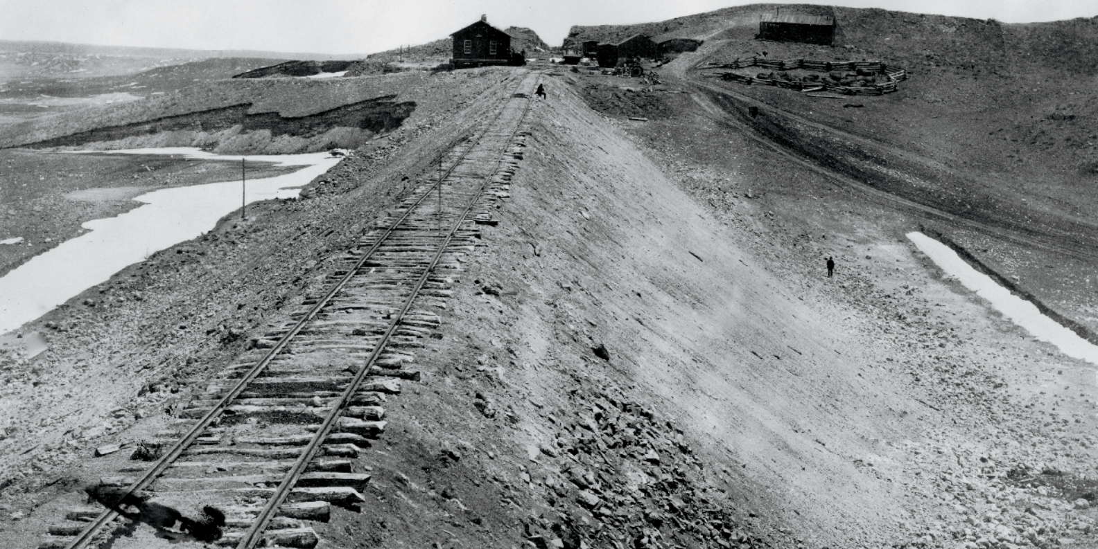
Roadbed and track construction on the original Union Pacific main line was fast and rudimentary. This scene in Wyoming shows the cut-and-fill work, as well as the lack of ballast and the rough-hewn ties that marked the initial effort at building a transcontinental railroad. A.J. Russell

terrain known as Sherman Hill. Construction continued westward, and by the end of 1867, the end of track had reached Granite Canon, 19 miles from Cheyenne, and 536 miles west of Omaha. Here, construction became more difficult. The highest and longest earthen fill was built during the winter months of 1867 and 1868. This work required manpower and mules, hand tools, wagons and carts, and blasting powder.