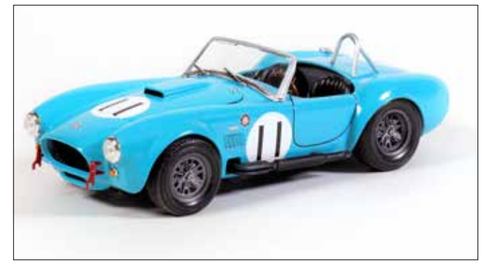
Tamiya Coral Blue paint graces the body of Brian Guggemos' out-of-the-box Monogram Shelby Cobra 427SC No. 11. The mighty Cobra was completed by Brian over a month's time.