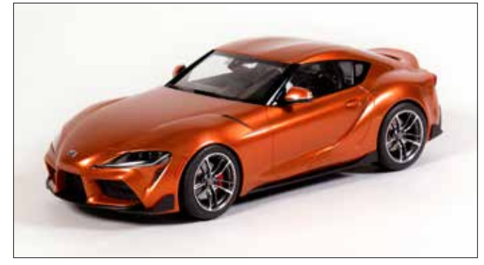
Joe Fotschky's build of Tamiya's new Toyota Supra came in box stock and wearing metallic orange paint. He was floored by the headlights that took five parts each with just as many decals to assemble and install!