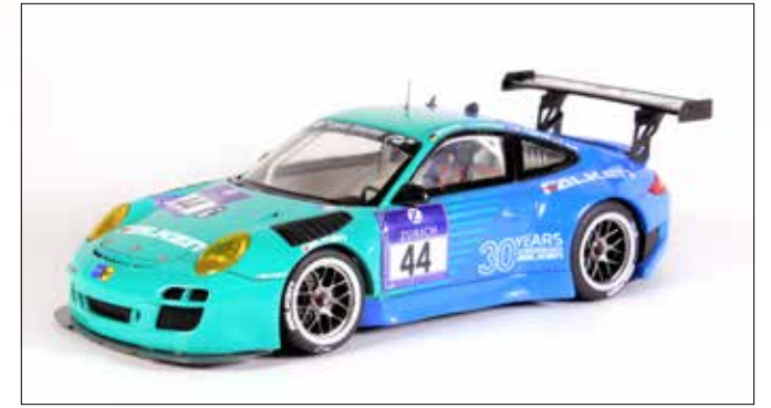
Bill Bauer's 2013 Falken Porsche 911R took approximately eight months to build. It started as a Fujimi 911R, but Bill upgraded with a resin body, NuNu decals, and Scale Productions wheels and tires.