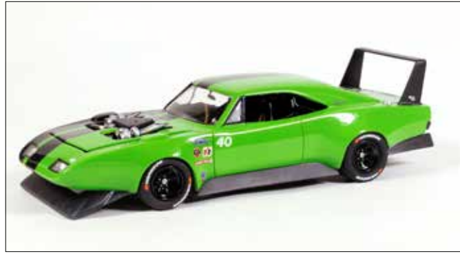
Batman's Two-Face would be proud to pilot this custom twinturbo creation from the warped mind of Rob Smorey. Rob's splitpersonality 1969 Dodge Daytona has been finished with a custom lime-green and black paint scheme. Hobby Design resin twin turbos beefed up the wired and plumbed engine. It all rolls on a set of NASCAR Generation 6 wheels and tires.