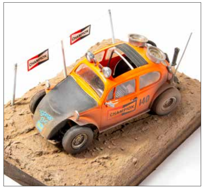
Working with a vintage Revell kit, Chris Valenti built a 1/25 scale Baja bug. He painted the off-road Volkswagen Beetle with Tamiya acrylics and added thin layers of pastel dust to match the Celluclay groundwork.

After modifying Lindberg's 1/25 scale Dodge "Little Red Wagon" with a resin A-100 van body from Jimmy Flintstone, Jeff LaMott worked on giving the model a distressed patina. He sprayed it with rust shades and then sealed that with a heavy coat of hairspray followed by salt. Jeff applied the body color when the air was humid, so the salt on the model absorbed the moisture and further discolored the surface. Brushing off the salt revealed a well-seasoned van.