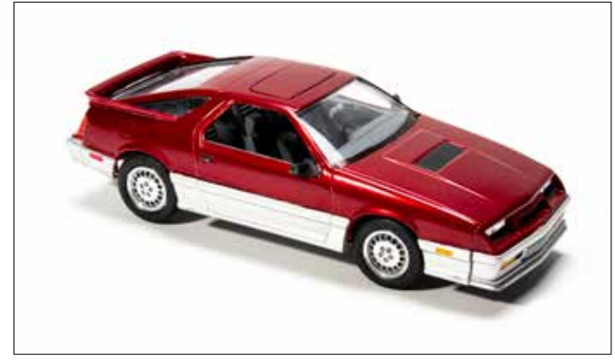
Duane Tripp built MPC's 1/25 scale 1988 Dodge Daytona Turbo out of the box and painted it with Dupli-Color Metallic Red and Clear. "Honestly, it is an amazing kit few people have given a chance – great detail and well designed," Duane says.

To replicate traditional lowriders he grew up around, Wes Salazar scratchbuilt hydraulics for Revell's 1/25 scale 1964 Impala. He dressed up the engine with machined pulleys and air cleaner, and finished with House of Kolor Root Beer Pearl and Clear.