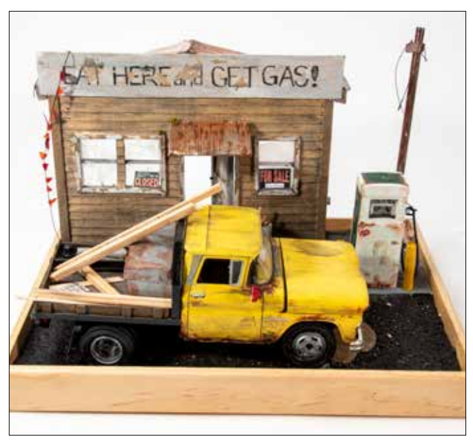
"It's based on a café I was familiar with in my grandparents' town that had one gas pump," says Scott Andeen. He scratchbuilt the café on foam board with a black, rubber-cork road. The pump came from a gas station kit. He modified AMT's 1/25 scale Chevy pickup with dual rear wheels and a flatbed.