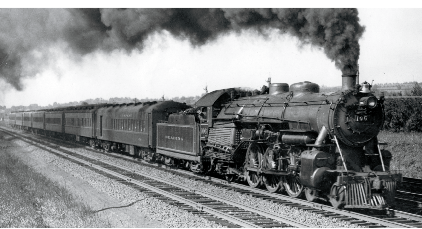
Six miles east of West Trenton, the engineer of Reading G-Isa 106 gives his steed a careful look as he wheels an eastbound express past GH Tower at 70 mph, 10 mph shy of the New York Branch's maximum. While Pennsylvania men called their Philadelphia-New York expresses "Clockers," Reading men referred to theirs as "Yorkers."

War is over that tree-lined horizon 9 miles east of West Trenton, and the evidence is an east-bound troop train negotiating Crusher Curve behind the tank of Reading center-cab I-8sb Consolidation 1604. The 1,400-mile road rostered more than 800 2-8-0s, built between 1880 and 1925; at 117 locomotives, the versatile I-8 was the most numerous of any Reading class.