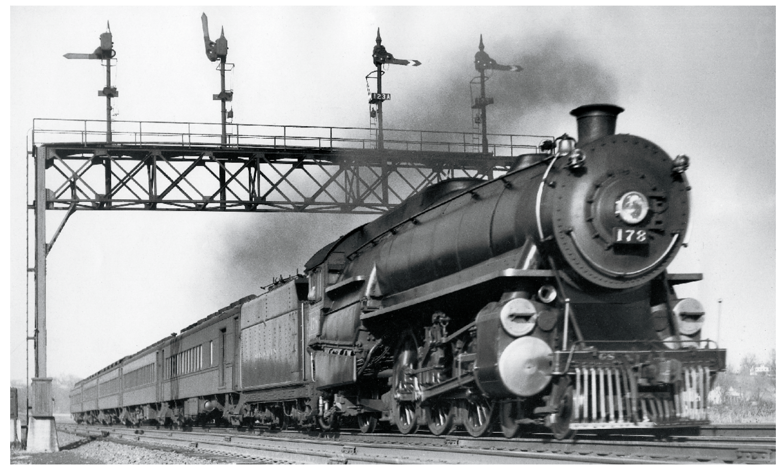
The semaphore blade has already begun to fall as Reading G-2sa Pacific 178 sweeps under the signal bridge near Glen Moore with a New York-Philadelphia express. In common with Delaware & Hudson, Reading became interested in clean-lined English engines and, as a result, semi-streamlined two Pacifics. Say, is that a horn tucked under the running board?