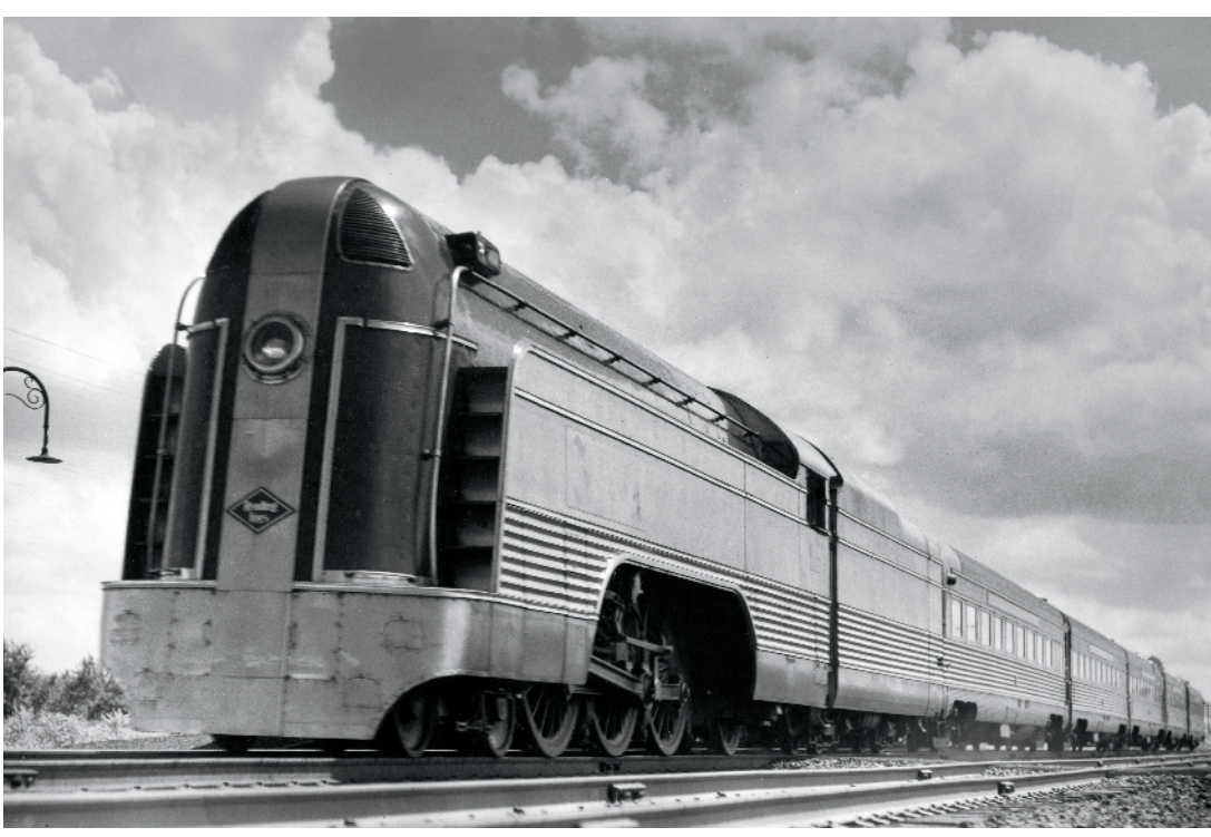
Some of West Trenton's trains were prosaic — electric M.U.'s from Philadelphia and gas-electrics from Bound Brook and Trenton. Some were exotic — including Reading's Budd-built Crusader , which made two Philadelphia-Jersey City round trips per day. Streamlined Pacific 118 (class G-1sas) accelerates the afternoon eastbound Crusader through Ewing.