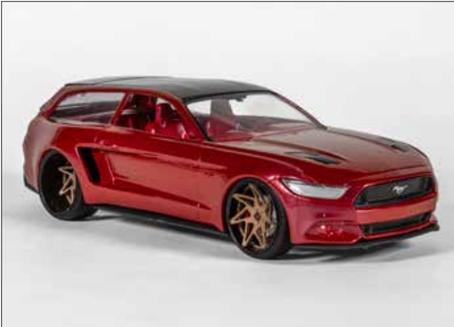
Ford should consider building a version of this Mustang touring car that Sam Kelly brought to the show. Combining a Mustang snap kit with a wide body and Dodge Magnum roof, Sam has created a version of the Mustang that would storm the wagon market.