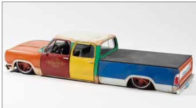
Rick Buikema kitbashed five kits into this 1/25 scale truck he calls Scrappy-Doo . He painted the pickup with enamel spray paint and weathered it with acrylics to make it look like his buddy's mud truck "with all different, rust-free panels."