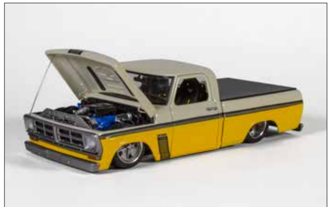
Rob Smorey's "Boss 302" Ford F-100 pickup features a transplanted powertrain from a Revell Boss Mustang, a lowered suspension with custom rolling stock, and a two-tone Tamiya Racing Yellow and White paint scheme with the iconic Boss 302 stripe decals.