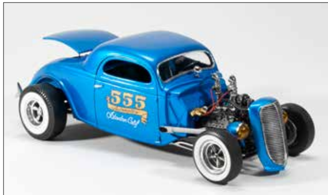
Vic Rood's AMT 1/25 scale 1936 Ford five-window coupe street rod has no shortage of modifications. He wired the motor and added a 1953 flathead V8, dual Stromberg 97 carbs, bomber seats, a 1937 Ford grille, and resin wheels and tires.