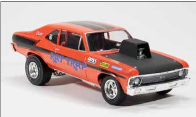
Inspired by a Hot Wheels car, Matt Key turned an AMT 1/24 scale '66 Nova pro street into this asphalt aggressor. He added Detail Master wires, fuel lines, and plumbing. Matt painted with Tamiya Orange lacquer and Tamiya Flat Black over Tamiya primer.