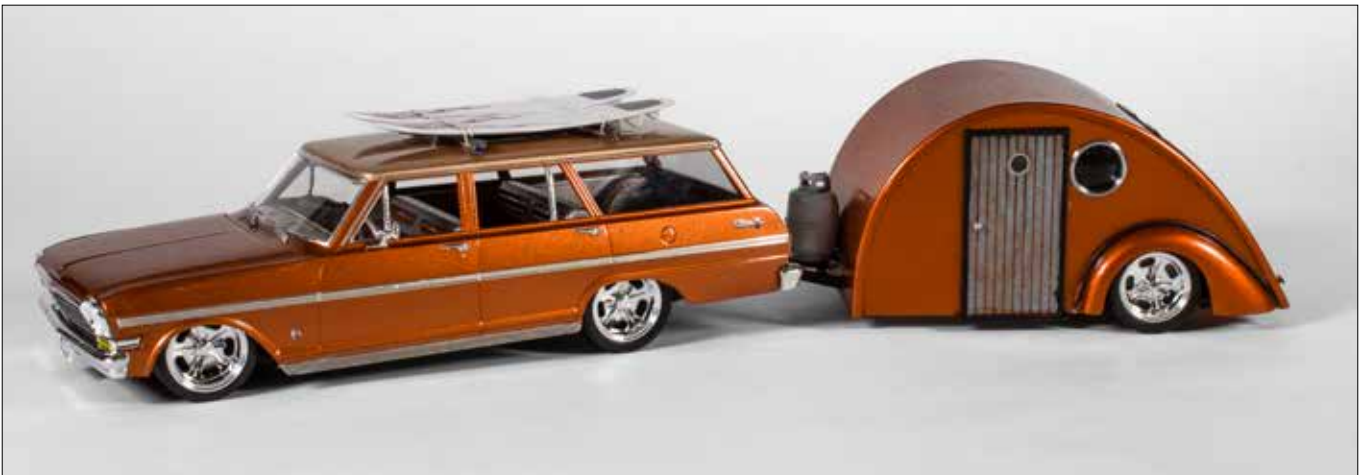
"Cruising the USA in my Chevrolet!" Kenny Shores built his sunset gold, 1963 Chevy II wagon box stock and scratchbuilt the teardrop trailer. Both are ready to hit the highway for many adventures.