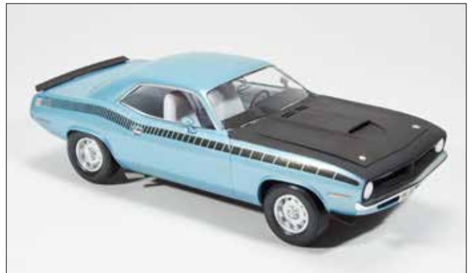
Fourteen-year-old Deven Lehst built this cool Revell 1/25 scale 1970 Plymouth 'Cuda AAR out of the box. He primed the car black, airbrushed two coats of water-based, custom-mixed paint, and finished it off with two coats of clear. Nicely done!