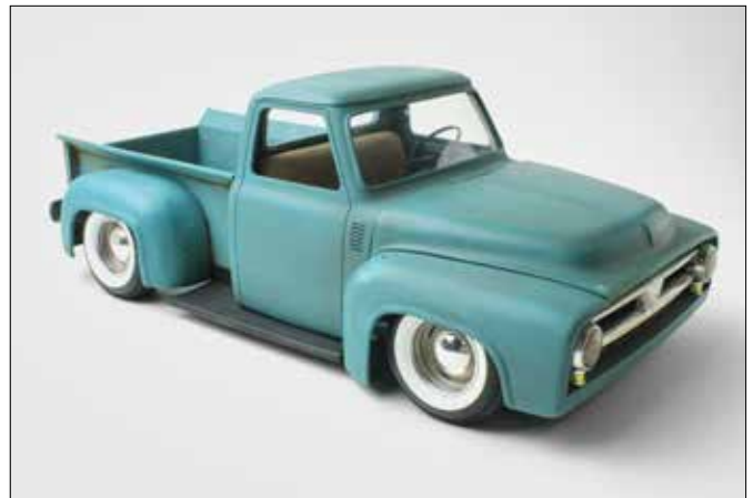
Alvis Barrington based his primarily scratchbuilt model on a Tamiya 1/10 scale Midnight Pumpkin radio-control car. He used Krylon enamels to paint and pastels to weather the model.