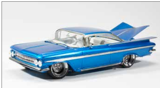
Tony Hartjes built a Revell 1/25 scale 1959 Chevy Impala hardtop as a custom. He modified it with scratchbuilt parts, including a tuck-and-roll interior with chrome wire trim, CAD-designed air filters, a 1000-watt amplifier, and custom-sculpted taillights. Tony also decked the hood and smoothed the roof.