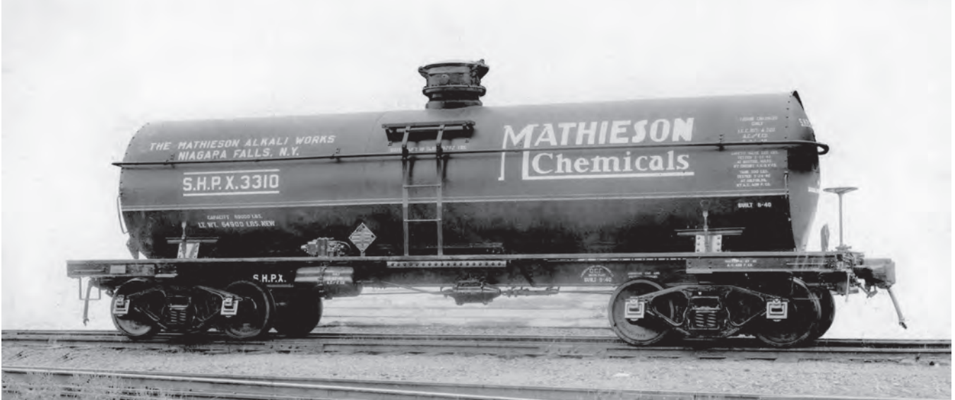
Mathieson Chemicals leased this chlorine car from Shippers Car Line. The 40-ton, ICC 105A 300 car was built by in 1940.