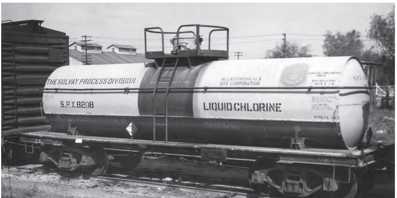
American Car & Foundry built this car for Solvay in 1934. It's a 5,800-gallon tank with a 40-ton capacity and a service platform and railing surrounding the bonnet. It has large manufacturer and commodity lettering. Roy E. Meates

Through the 1910s, chlorine and other pressurized goods were shipped in small tanks that were loaded aboard other freight cars; standard tank cars were only used for liquids not under