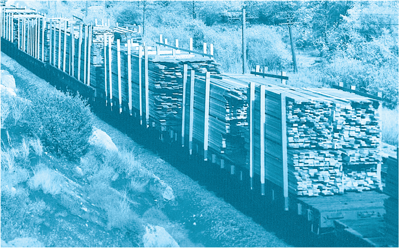
Through the 1950s, lumber loads were hand-stacked on flatcars. Large posts in the cars' stake pockets hold the loads; posts were tied together with planks or wire across the tops of the loads. This is on Union Pacific in the 1940s. Union Pacific

Most lumber in the U.S. is used for housing, so there is a close correlation between lumber traffic and the new-housing market. One modern center-beam car carries enough framing lumber to build five or six new houses.