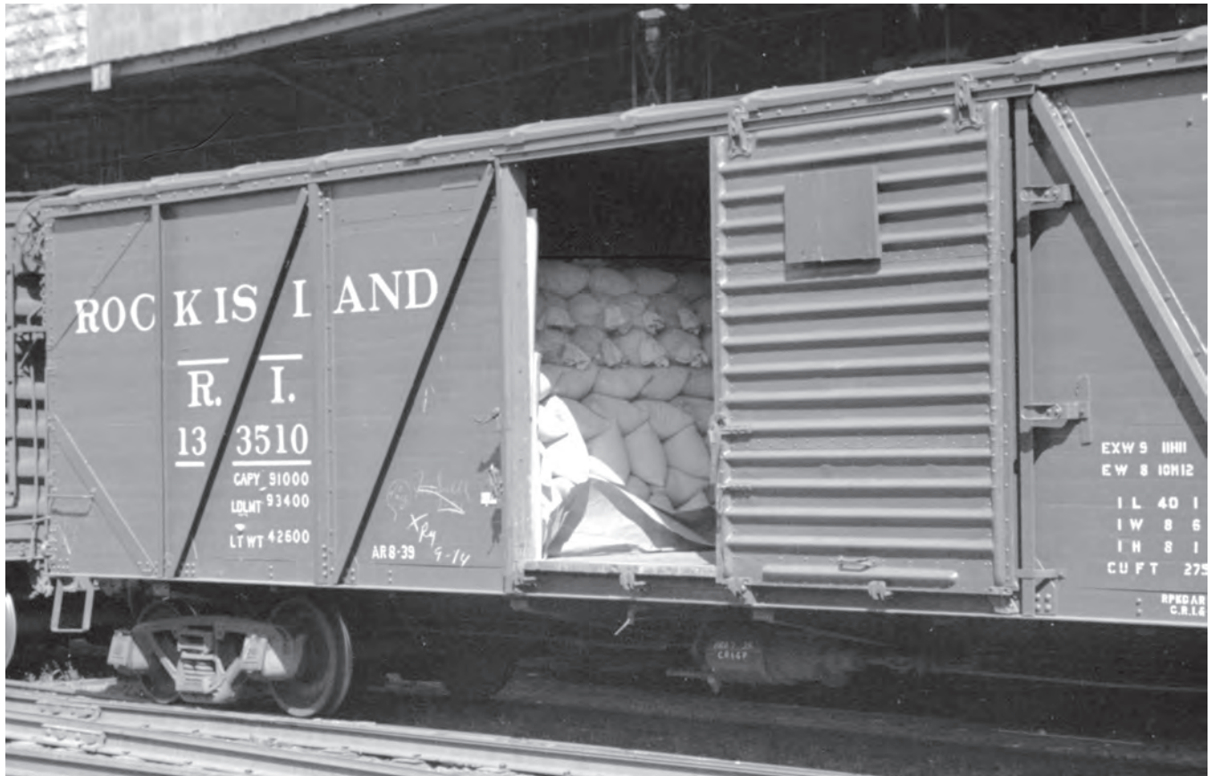
Hundred-pound bags were the common method of shipping flour through the 1940s. This single-sheathed Rock Island 40-foot boxcar has just been loaded at the Pillsbury Mill in Minneapolis in 1939.

Flour milling had become a huge industry by the late 1800s, with large-scale milling centers well established in Minneapolis, Minn.; Buffalo, N.Y.; and other areas. Sugar refineries, likewise, had become larger, centered in sugar beet-growing areas of the Midwest and West.