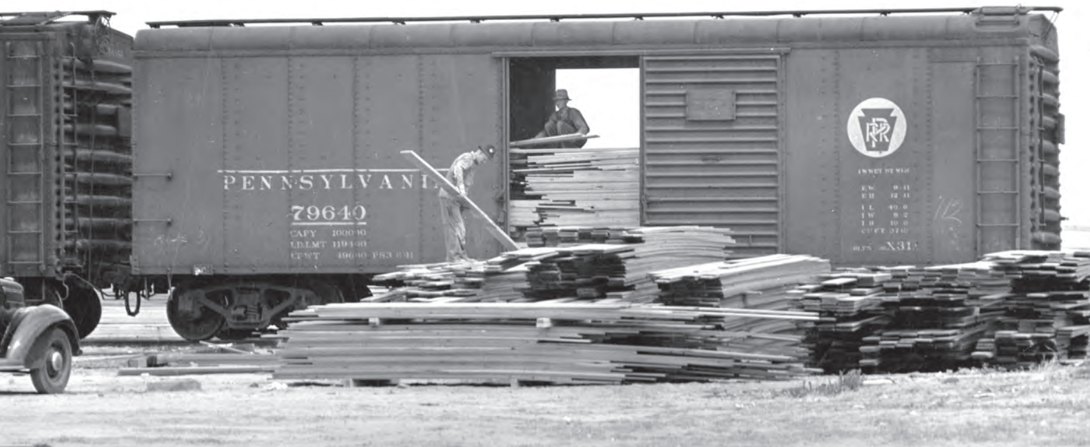
Standard 40-foot boxcars protected lumber loads well, but loading and unloading them stick-by-stick was time- and labor-intensive.

These became popular for lumber loads, as they contained extreme lengthwise shifting of loads. They were built in a wide variety of styles. A disadvantage was that the bulkheads added extra weight that took away from car capacity.