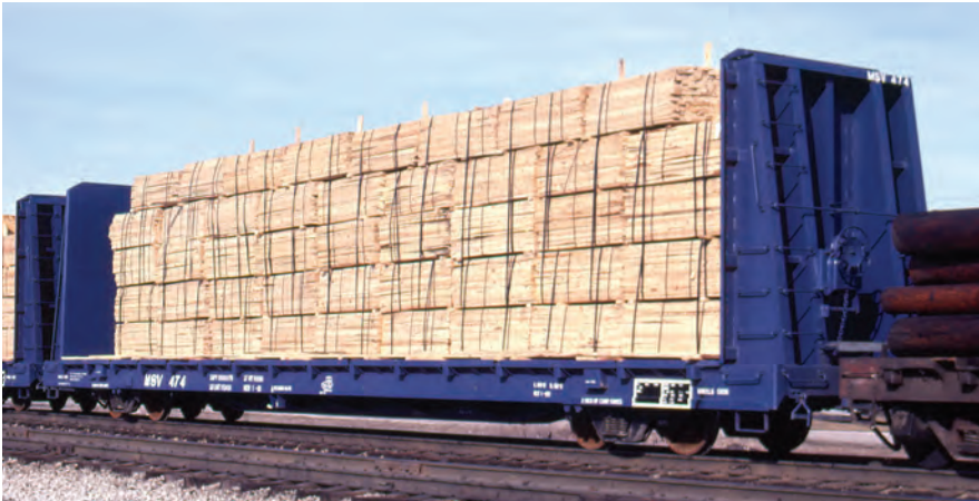
Bulkhead flatcars provide increased load stability compared to standard flats. This 62-foot Mississippi & Skuna Valley car is loaded with rather loosely stacked bundles in 1980.

Dimensional lumber for construction has always presented a challenge in transporting, as it's made in lengths from 8 to 16 feet, making it difficult to load in boxcars.