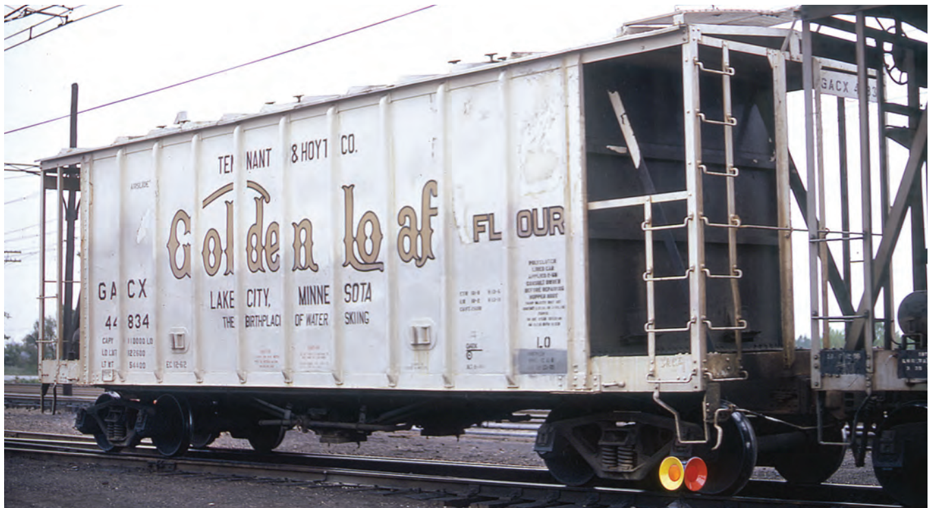
Through the 1960s, Airslide cars often carried the logos of their lessees, in this case Minnesota's Tennant & Hoyt, makers of Golden Loaf Flour. The 2,600-cf car, built in 1961, is shown in 1970. J. David Ingles