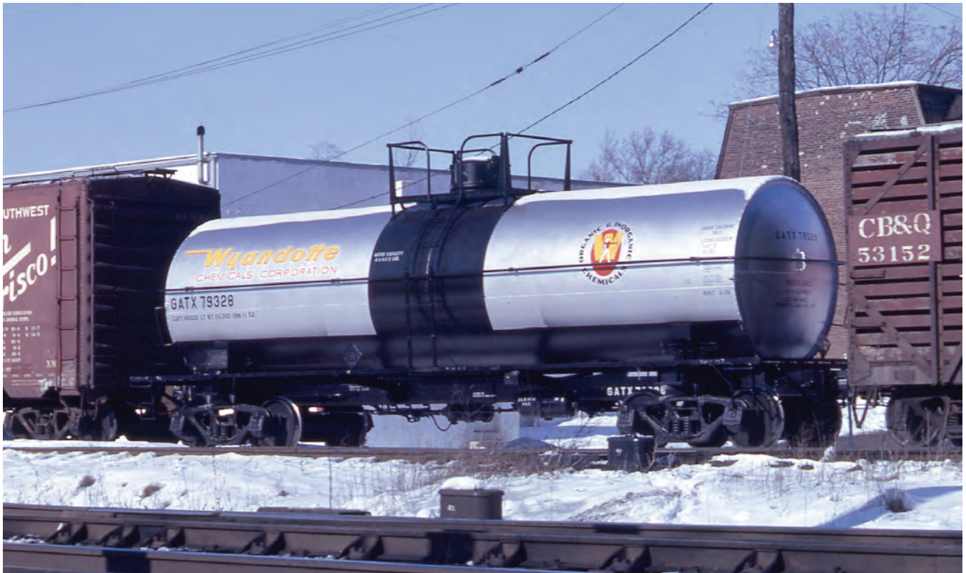
General American built this 10,500-gallon pressure car in 1952. It's leased to Wyandotte Chemicals and carrying chlorine. The 70-ton car has a coating of snow atop it in this 1962 view. J. David Ingles

size (30- or 40-ton capacity) were common. These cars often stood out in trains because of their small diameters compared to typical 8,000- and 10,000-gallon general purpose tank cars. Even after larger (10,500-gallon, 50-ton) cars began appearing in the 1940s, many smaller cars were built and remained in service into the 1960s and later, serving customers who didn't require larger shipments. Size is a spotting feature of chlorine cars, as they are much smaller than pressure cars carrying LPG or anhydrous ammonia, both of which have about half the density of chlorine.