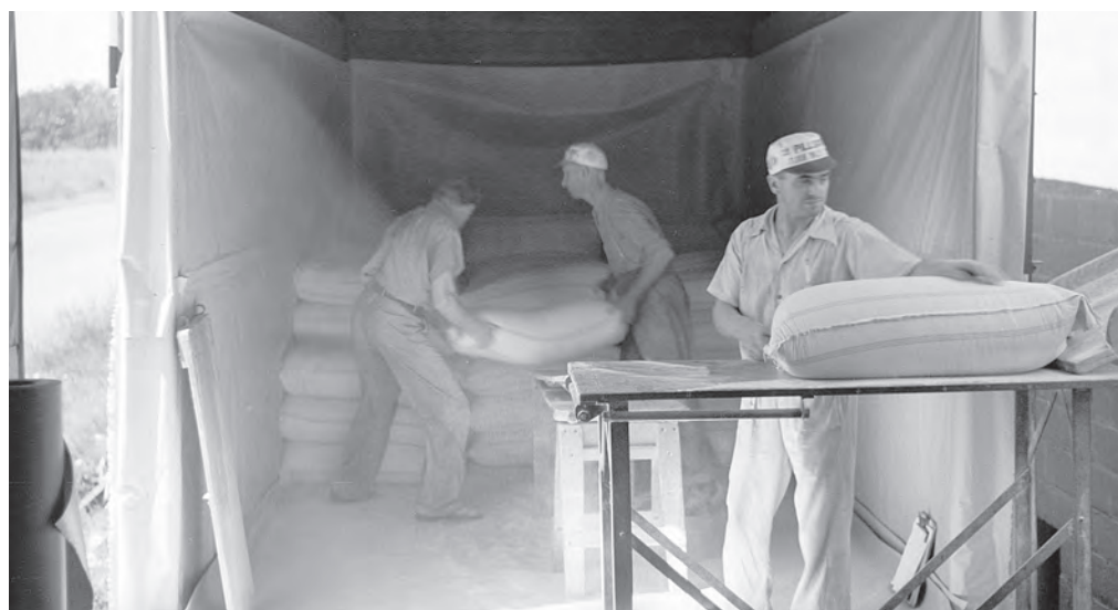
Flour sacks were easily damaged and contaminated, so cars had to be tightly sealed and free of protruding nails and wood splinters. The walls, floor, and door openings were lined with paper.

A great deal of these products traveled by rail, with many long-distance shipments to end users located across the continent. The standard