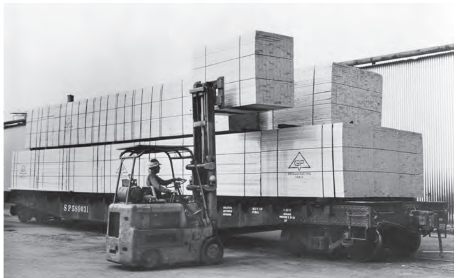
Southern Pacific staged this photo in 1963 to show the then-innovative technique of bundling loads, which allows easy loading and unloading by forklift. The railroad also noted that bundling allowed larger loads: about 75,000 board-feet (bf) here, compared to about 42,000 bf for a hand-stacked load.

Lumber-producing areas will see the highest concentration of rail traffic, with railcars going literally everywhere in the country. The final destination for lumber cars today is usually a large reload center or lumber distribution company that stores and reloads products onto trucks for final delivery to lumber yards and contractors. Through the 1960s, deliveries direct to lumber yards were common; small