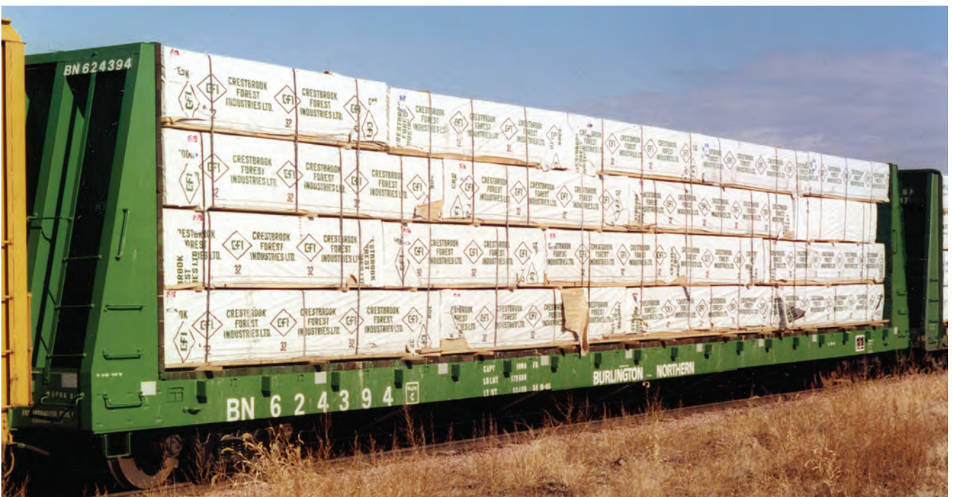
By the 1970s, bundled loads were often wrapped to protect them. This 70-foot, 80-ton Burlington Northern bulkhead flatcar is carrying wrapped, bundled loads in the late 1980s.

Loads were secured by vertical posts in the car's stake pockets. The posts were tapered slightly at the bottom and sized to force-fit in the pockets. These posts would be secured across the top of the load by horizontal boards, wire, or cable, pulling the sides together and compressing downward on the stacks as much as possible to limit shifting.