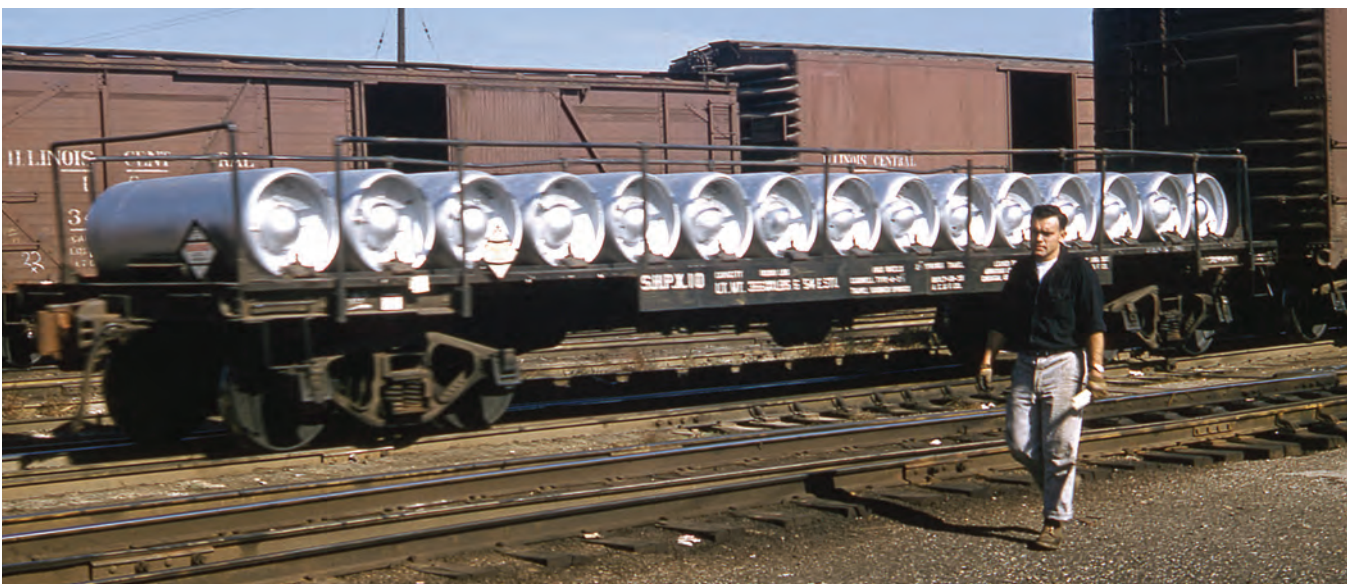
From the 1930s through the 1960s, specially equipped flatcars (AAR class TMU) carried chlorine "ton containers" in built-in cradles on the deck; clamps secure the ends/rims of each cylinder. Each of the 15 cylinders weighs about 3,500 pounds loaded. The ACF car above is carrying loaded containers through Chicago in October 1960.