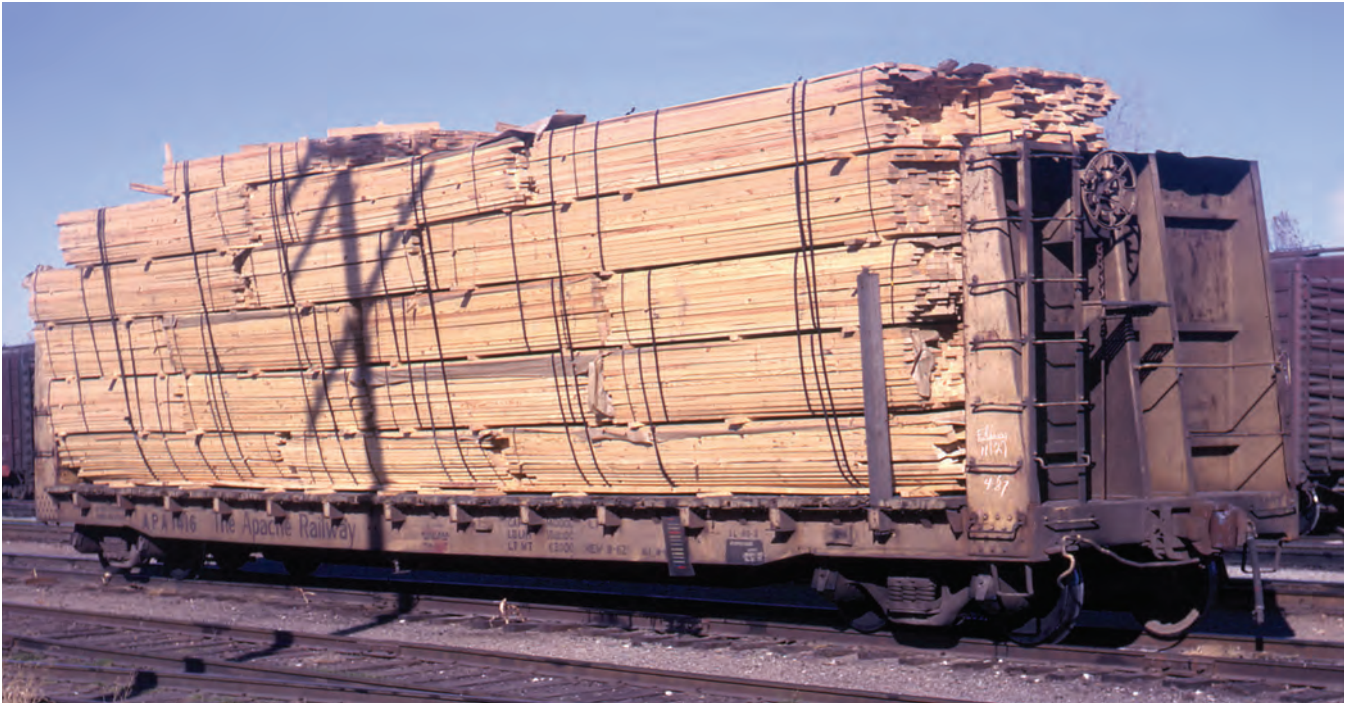
Shifted loads were a problem with standard and bulkhead flats. Train motion has shifted and misaligned the lumber load significantly on this Apache car in 1969; it has been set out for restacking at Topeka, Kan.

As you can imagine, along with being labor-intensive, this method did not secure the loads tightly. Boards were prone to shifting lengthwise during hard coupling or slack running in and out, and rocking motion could cause lateral misalignment, as well.