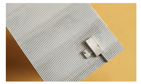
The remaining items came from my evergrowing collection of scrap and detail parts. I referenced prototype photos for the style and placement of all the parts, knowing I can always come back later and add or remove as information becomes available.

One of the key details is the large roof auger that sits atop the grain bin at the southern end of the scene. Despite searching for a suitable product, I was never able to locate an appropriate version in HO scale. I finally lucked out when I discovered an auger kit from Bossen Implement, a farm toy dealer located in eastern lowa. While the kit is scaled at 1/64th of full size (S scale), I was able to cut down the main tube to better fit my 1/87th scale needs. The supports for the auger atop the bin were shaped from .025" piano wire.