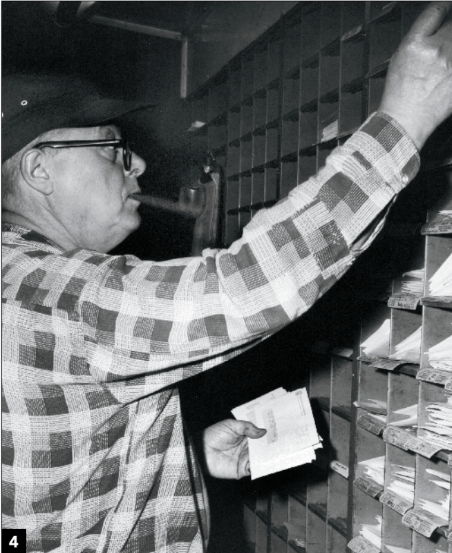
Railway postal clerks were federal employees. Here, a clerk works on the last RPO in service, New York & Washington (on Amtrak), in October 1972.