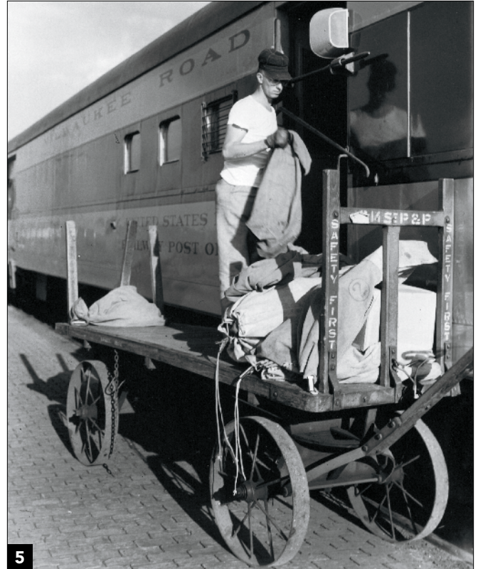
Mail bags are transferred from a Milwaukee Road RPO on the eastbound Midwest Hiawatha at Davis Junction, Ill., in the early 1950s.

Service grew dramatically as railroads expanded routes throughout the country. In 1875, mail service covered 70,083 route-miles. By 1900, the service had more than doubled, to 179,982 miles, with 1,300 RPO routes serving the country.