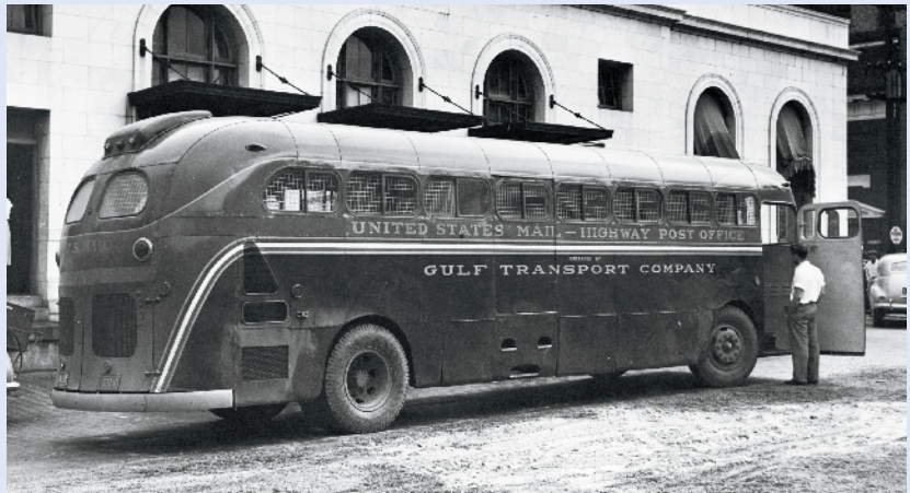
This Highway Post Office bus, shown in 1948, was operated by Gulf Transport, a subsidiary of Gulf, Mobile & Ohio. William Lavendar

The Highway Post Office (HPO) was a service begun in 1941 in response to declining rail passenger routes, with an ultimate goal of replacing the RPO system. Each HPO was a bus, outfitted with an interior like a RPO car with cases, pouch racks, and sorting tables. Clerks worked mail in transit, stopping to pick up and drop off mail at post offices along the route. Outside, the buses wore various red, white, and blue paint schemes with HIGHWAY POST OFFICE lettering.