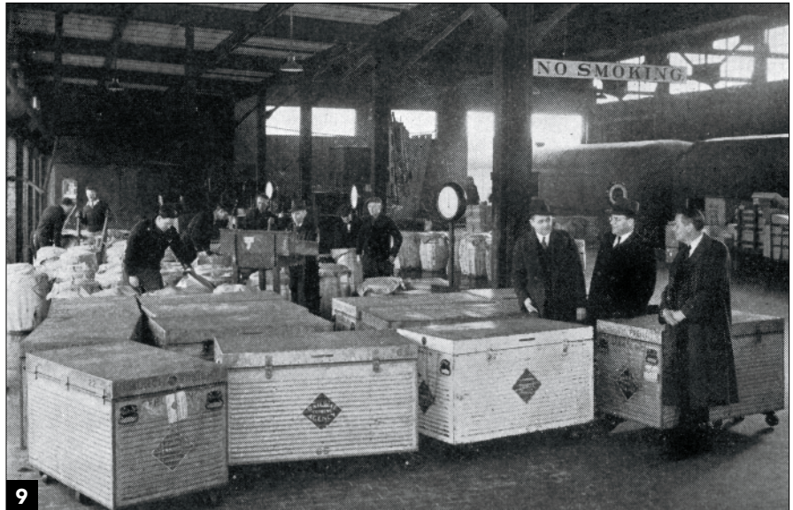
Church containers were wheeled, insulated chests that could carry a small refrigerated load and either water or dry ice. They were easily loaded on trucks or railcars. Railway Express Agency

Shippers were willing to pay express rates for items that were very perishable. Most berries, for example, had short shelf lives, and were almost always shipped by express, 7. Express