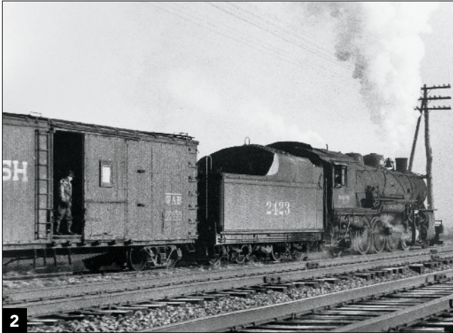
2 Peddler cars (or waycars) carried LCL to multiple stations along a route. Some were specially equipped and manned by messengers, as is this car on the Wabash at Marshfield, Ind., in 1948.