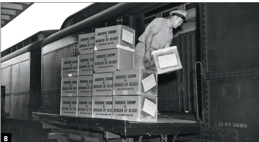
8 Fish and seafood often traveled by express. Here, fresh shrimp in insulated, foamed-lined cases is loaded aboard a standard baggage express car at Biloxi, Miss. Goodyear

Valuables, including jewelry, precious metals, negotiated checks, bonds, and cash, were frequently shipped via REA. The U.S. government was a major customer for this, as Federal Reserve Banks used REA to send cash among branches, and the government sent cash to military bases for payroll. A safe in the REA messenger's baggage car served as the repository. REA agencies in depots had safes to store valuables, 3, while large terminals had a "value room" for cash and valuables, with armed guards on duty. Larger shipments of gold, silver, and ore would have multiple armed guards and messengers.