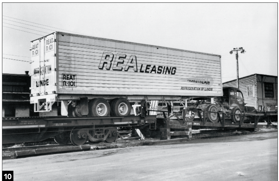
REA started REA Leasing Corp. (Realco) in the early 1960s, selling the division at a profit in 1969. This cryogenic trailer was new in 1961. Railway Express Agency

rates were also paid for high-demand products, such as the first fruits produced in a given growing season or region, or those products known for being the best of their type. Other perishables requiring refrigeration that traveled in express reefers included cut flowers; many types of plants, including strawberry and tomato; prepacked gift baskets and packages of fruit, meat, and cheese; and fresh fish and seafood.