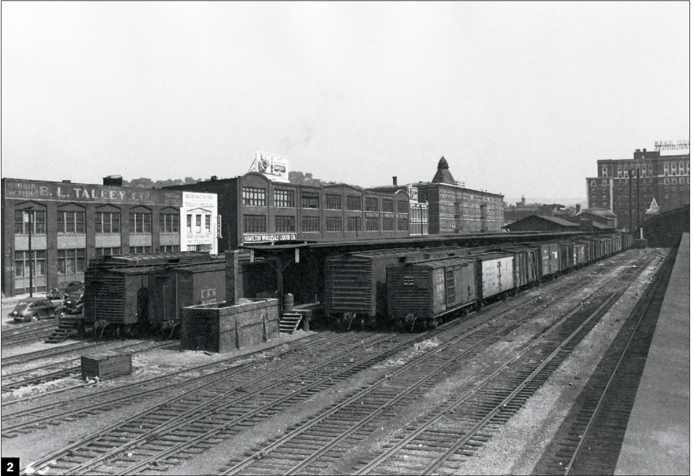
2 The Nashville, Chattanooga & St. Louis freight station in Chattanooga was one of hundreds of terminals around the country where LCL freight was transferred and reloaded among boxcars. NC&StL

Mail now travels by truck or plane, and although some does indeed still travel by rail, it's in sealed trailers and containers that ride atop railcars, and clerks no longer sort mail inside specialized cars as trains roll along.