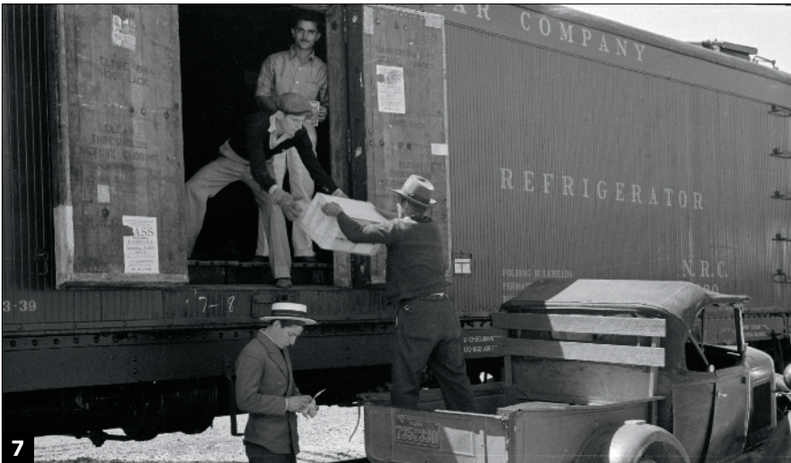
7 Cases of strawberries are transferred from pickup trucks to a National Refrigerator Car express reefer at Hammond, La., in 1939. REA handled LCL and carload lots of refrigerated express in its own cars as well as railroad-owned cars.