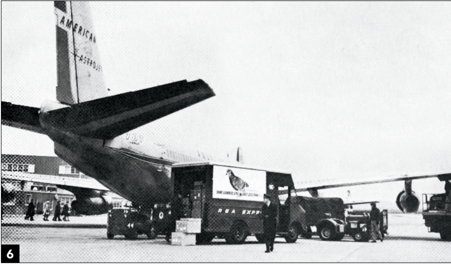
6 An REA step van delivers air express packages directly on the tarmac to a waiting American Airlines 707 in the early 1960s.