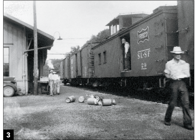
3 Some railroads used side-door cabooses to carry LCL on branch lines. Here, the St. Louis-San Francisco crew has just unloaded several empty milk cans at Steelville, Mo., in 1949.

Express shipments, along with mail (more on that in chapter 7) traveled via passenger trains, while cars of less-than-carload (LCL) traffic were carried in freight trains, 1 . Let's first take a brief look at LCL car and train operations.