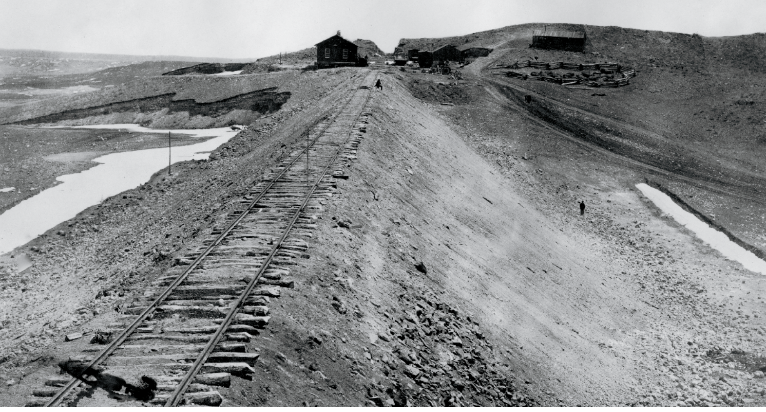
Roadbed and track construction on the original Union Pacific main line was fast and rudimentary. This scene in Wyoming shows the cut-and-fill work, as well as the lack of ballast and the rough-hewn ties that marked the initial effort at building a transcontinental railroad. A.J. Russell

terrain known as Sherman Hill. Construction continued westward, and by the end of 1867, the end of track had reached Granite Canon, 19 miles from Cheyenne, and 536 miles west of Omaha. Here, construction became more difficult. The highest and longest earthen fill was built during the winter months of 1867 and 1868. This work required manpower and mules, hand tools, wagons and carts, and blasting powder.