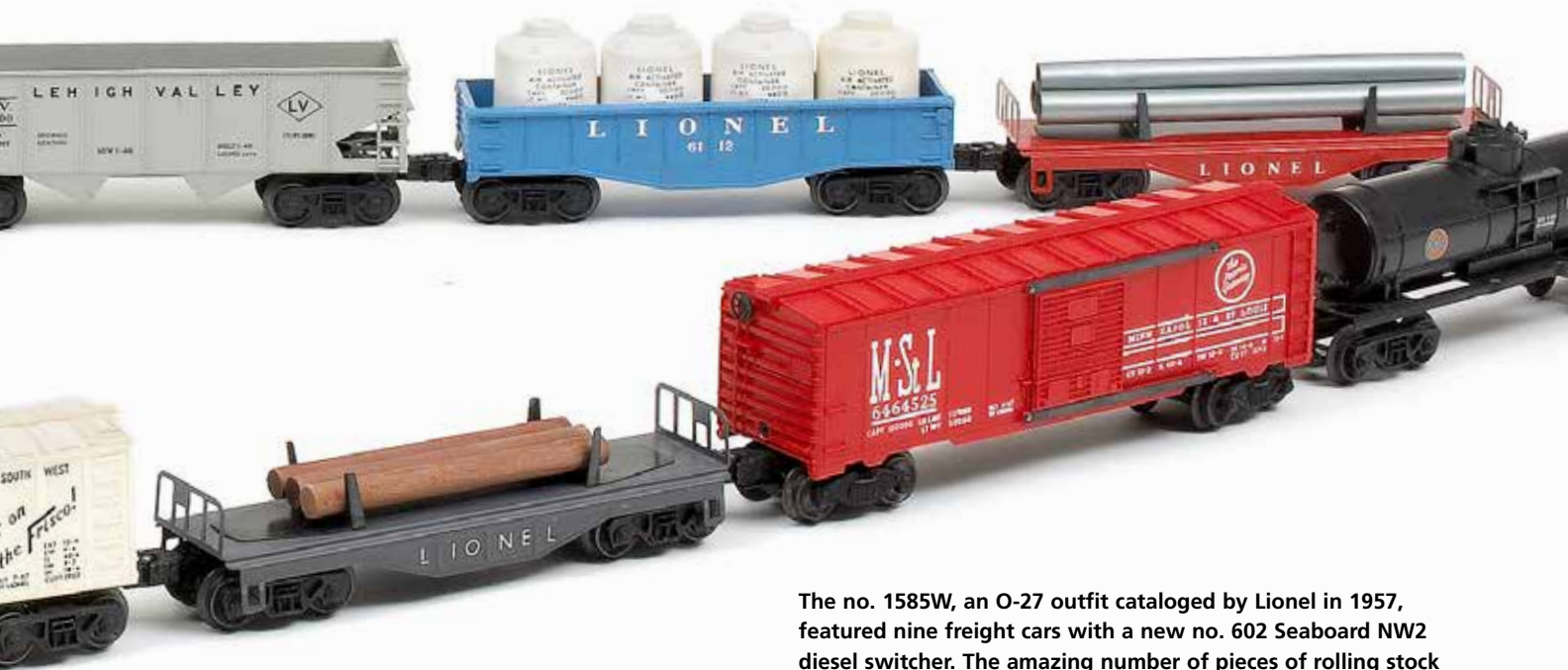
The no. 1585W, an O-27 outfit cataloged by Lionel in 1957, featured nine freight cars with a new no. 602 Seaboard NW2 diesel switcher. The amazing number of pieces of rolling stock made it the longest set Lionel cataloged during postwar days.

In 1957, changes made at Lionel during the previous 3 years made increasing the number of freight cars in a set easier. Designers began cheapening the construction of diesel switchers in 1955. They also reduced the weight of F3 diesels by making them in an A-B combination instead of an A-A.