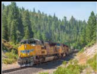
Union Pacific Photo by Jim Wrinn