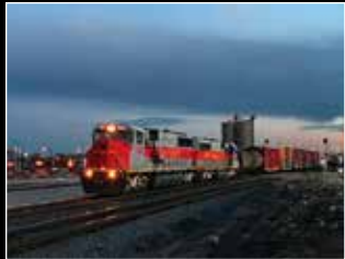
Utah Railway