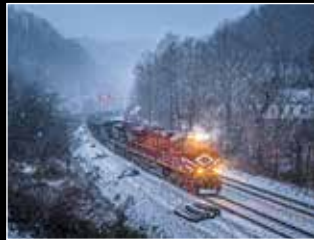
NS/Lehigh Valley