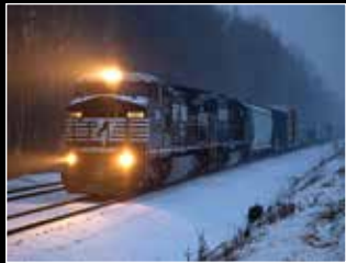
Norfolk Southern Photo by Michael Ridenhour

This beautifully photographed calendar showcases a variety of hard-working trains, including Class I, shortline, and passenger units, in breathtaking scenes across the country. The calendar also includes a look at the restoration of two Civil War locomotives.