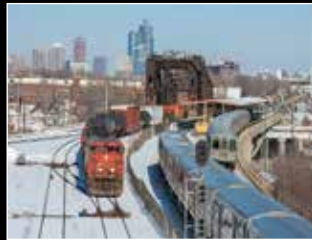
Canadian National