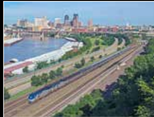
Amtrak