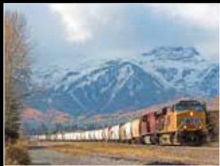
Canadian Pacific