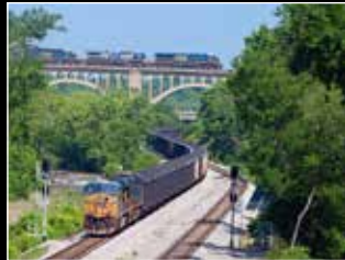
CSX Photo by Balaji Parthasarathy