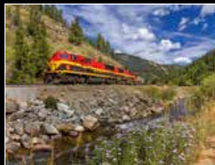
Kansas City Southern