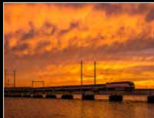
NJ Transit Photo by Eugene Armer