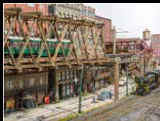
Blue Ridge & Allegheny Ron Hale