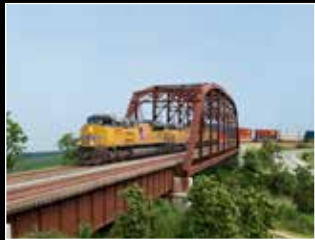
UP Daneburg Subdivision Pelle Søbørg

You'll find inspiration all year long with these 12 scenic layouts, which were featured in Model Railroader or Great Model Railroads . Encompassing a range of scales, locations, and railroads, these layouts offer something for everyone. A look at MR's Beer Line layout is also included.