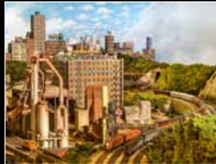
Grand Street & Three Rivers Rod Stewart