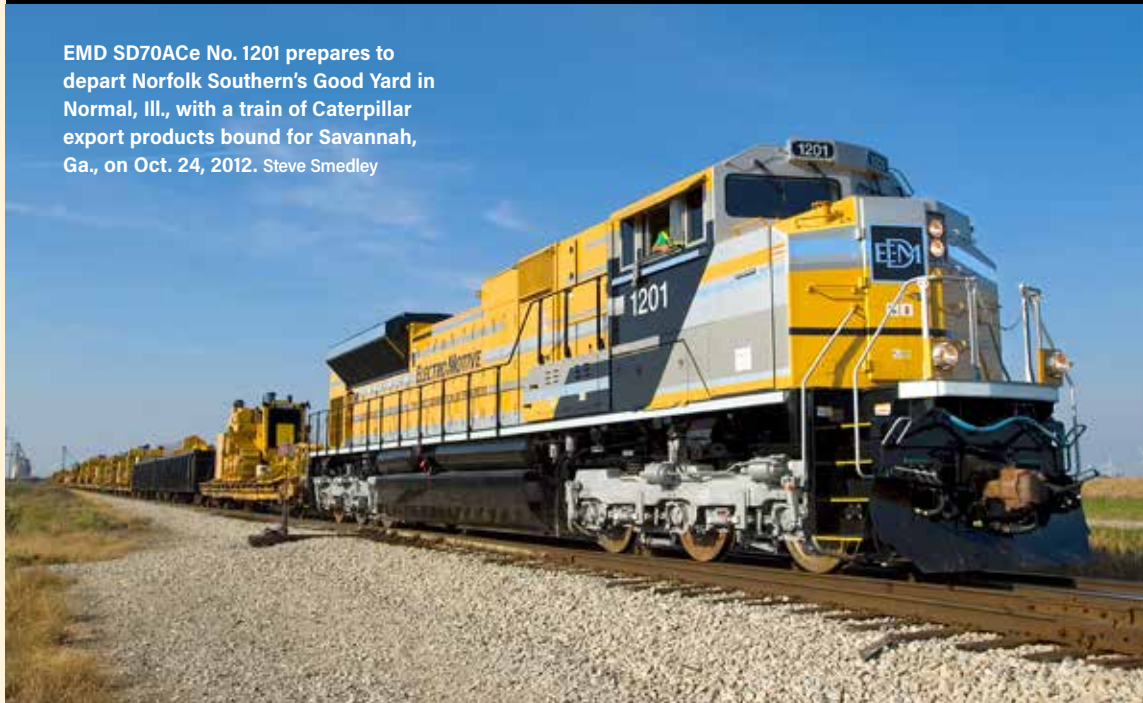
EMD SD70ACe No. 1201 prepares to depart Norfolk Southern's Good Yard in Normal, Ill., with a train of Caterpillar export products bound for Savannah, Ga., on Oct. 24, 2012.