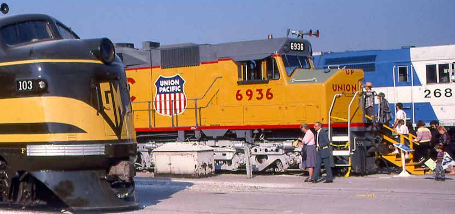
Restored FT demonstrator No. 103 keeps company with a Union Pacific DDA40X — which helped test components introduced on the SD40-2 — at an EMD open house in 1989. Just visible: SDP40F-turned-test-bed No. 268.

competent hands — but the move to power freight trains away from the comfortable confines of yards and their attending facilities was still in its infancy.