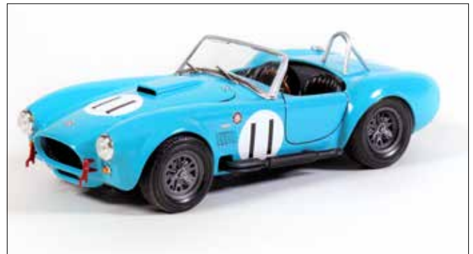
Tamiya Coral Blue paint graces the body of Brian Guggemos' out-of-the-box Monogram Shelby Cobra 427SC No. 11. The mighty Cobra was completed by Brian over a month's time.