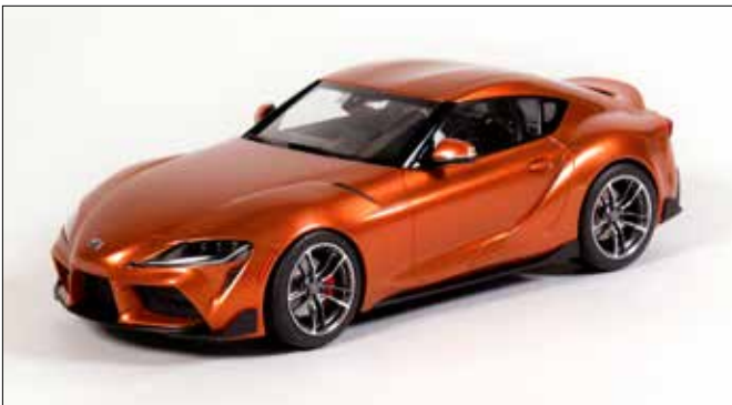
Joe Fotschky's build of Tamiya's new Toyota Supra came in box stock and wearing metallic orange paint. He was floored by the headlights that took five parts each with just as many decals to assemble and install!