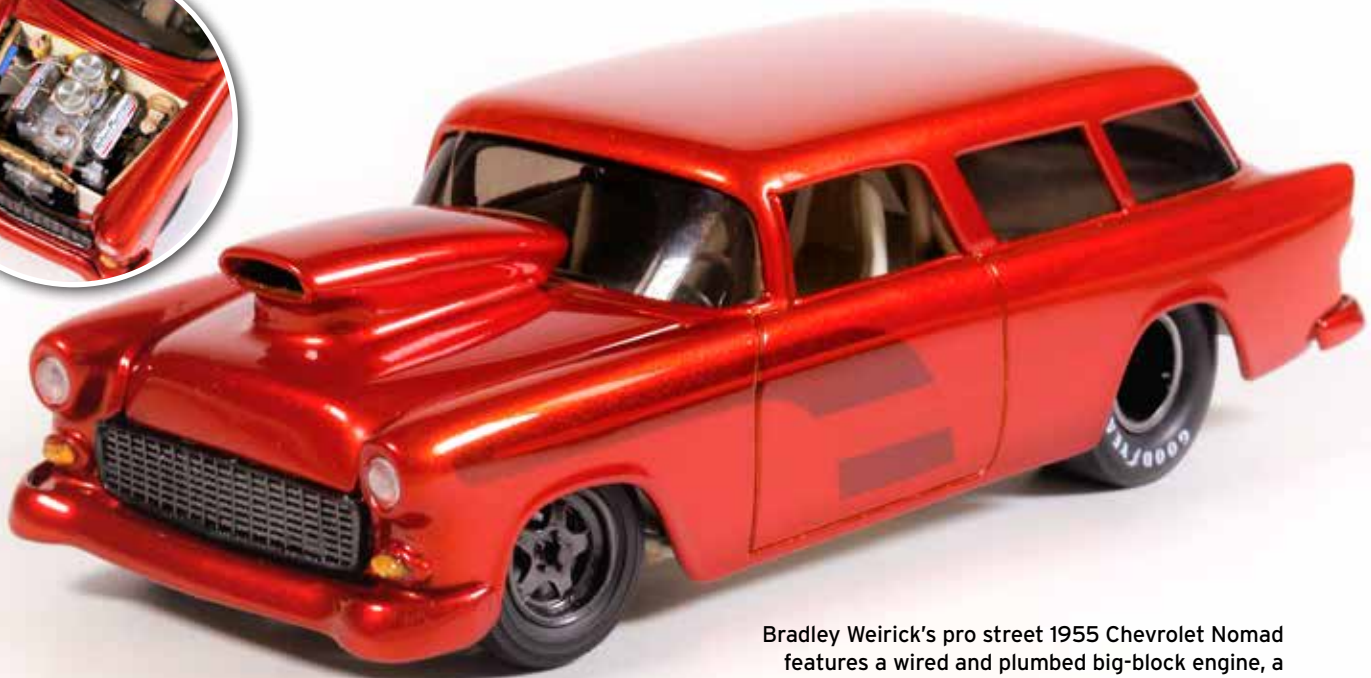
Bradley Weirick's pro street 1955 Chevrolet Nomad features a wired and plumbed big-block engine, a custom chassis, and candy gold and orange automotive paint with subtle graphics on the fender and doors.