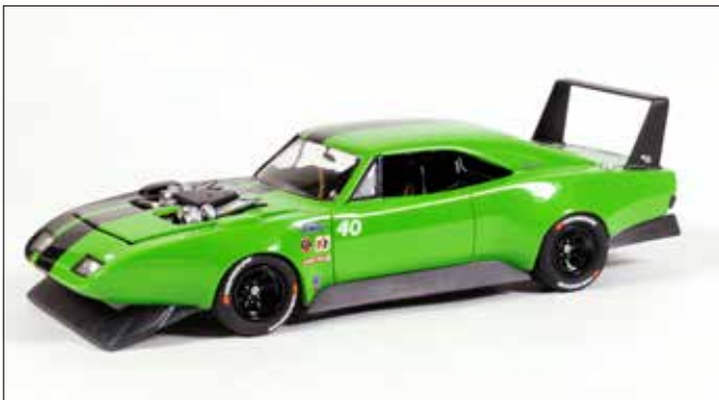
Batman's Two-Face would be proud to pilot this custom twin-turbo creation from the warped mind of Rob Smorey. Rob's split-personality 1969 Dodge Daytona has been finished with a custom lime-green and black paint scheme. Hobby Design resin twin turbos beefed up the wired and plumbed engine. It all rolls on a set of NASCAR Generation 6 wheels and tires.