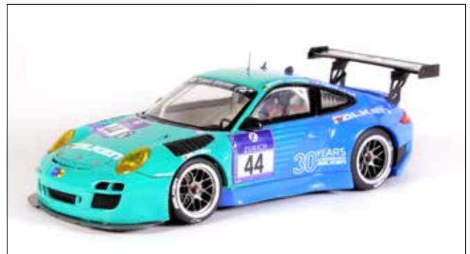
Bill Bauer's 2013 Falken Porsche 911R took approximately eight months to build. It started as a Fujimi 911R, but Bill upgraded with a resin body, NuNu decals, and Scale Productions wheels and tires.