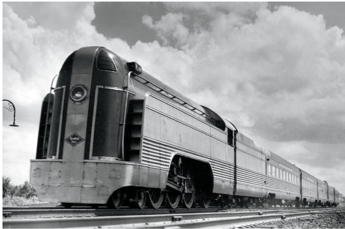
Some of West Trenton's trains were prosaic – electric M.U.'s from Philadelphia and gas-electrics from Bound Brook and Trenton. Some were exotic – including Reading's Budd-built Crusader , which made two Philadelphia-Jersey City round trips per day. Streamlined Pacific 118 (class G-1sas) accelerates the afternoon eastbound Crusader through Ewing.