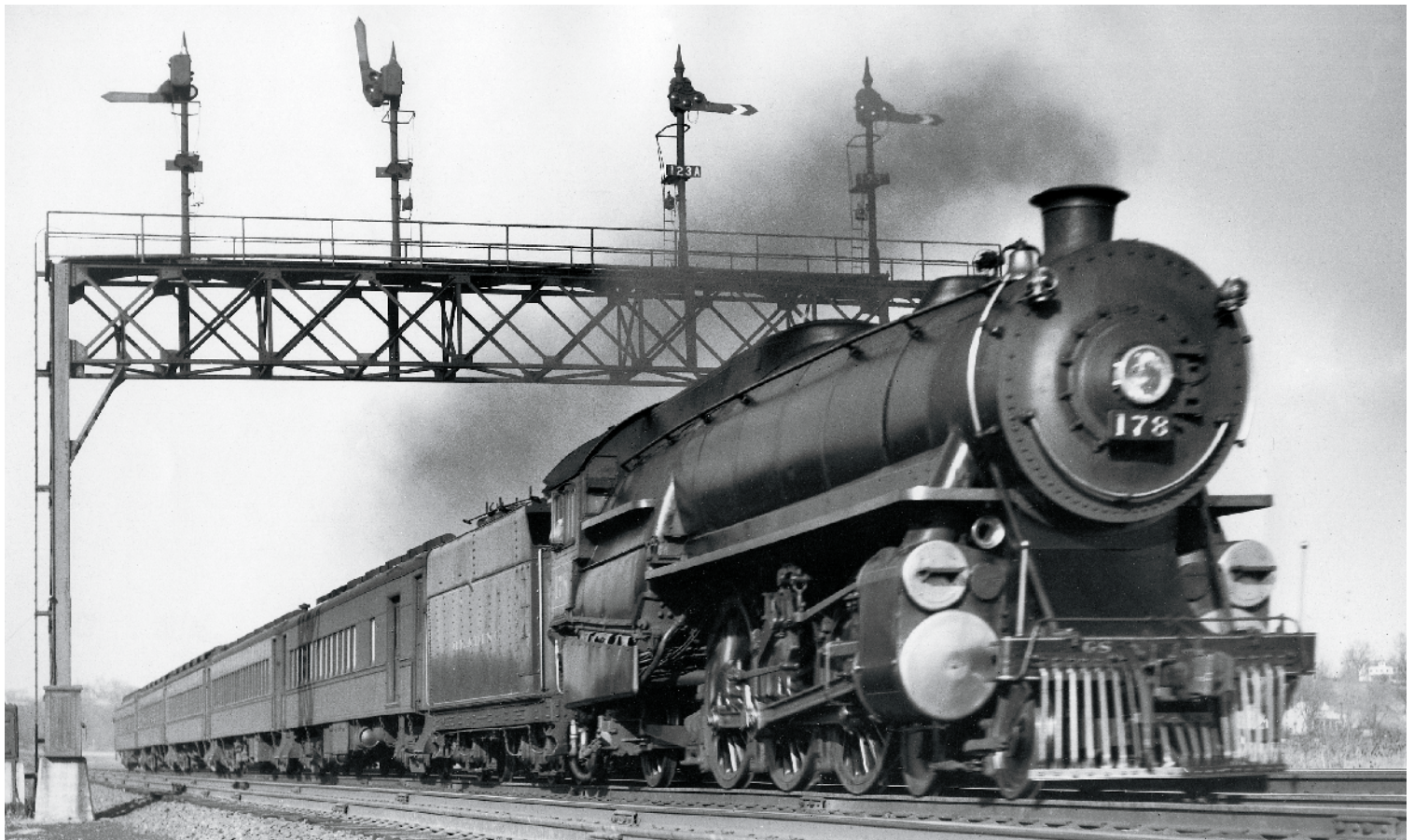
The semaphore blade has already begun to fall as Reading G-2sa Pacific 178 sweeps under the signal bridge near Glen Moore with a New York-Philadelphia express. In common with Delaware & Hudson, Reading became interested in clean-lined English engines and, as a result, semi-streamlined two Pacifics. Say, is that a horn tucked under the running board?